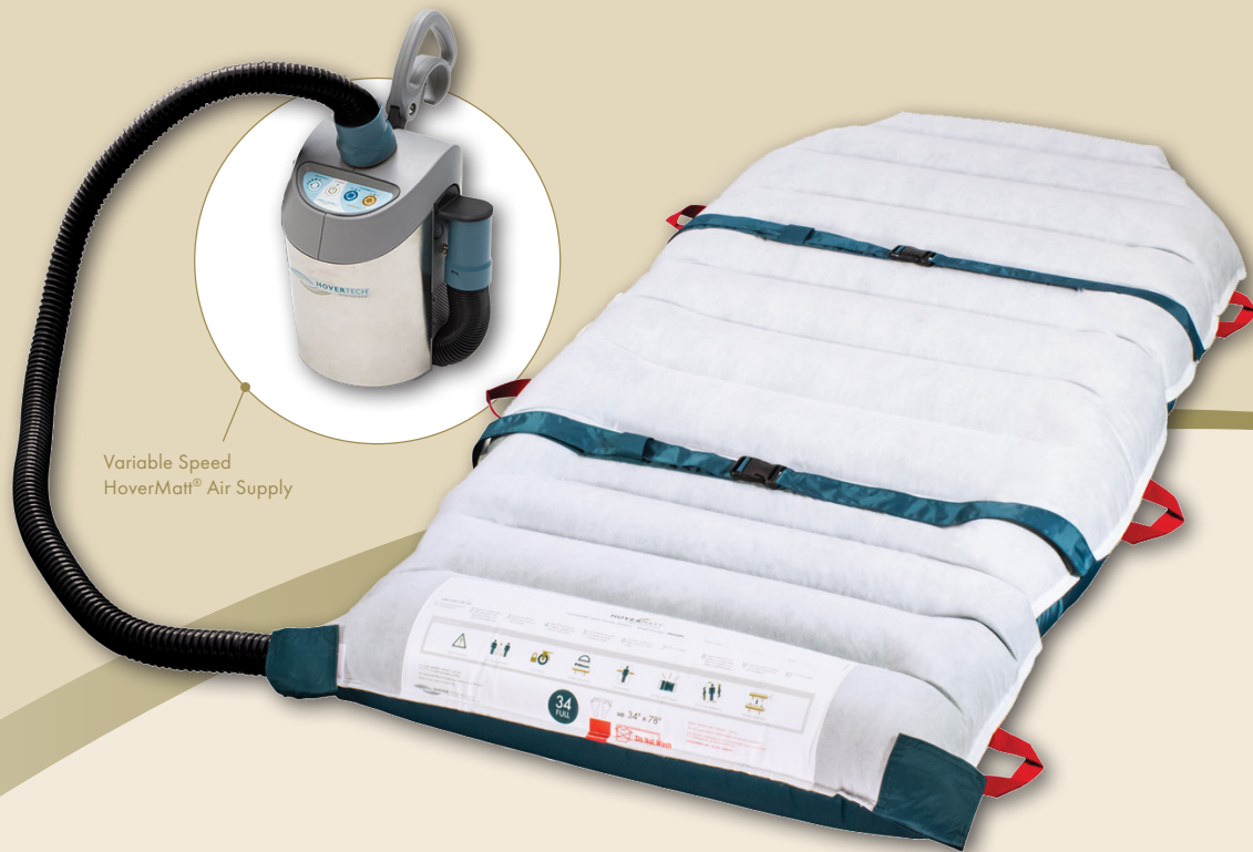
Variable Speed HoverMatt® Air Supply

The number one choice for lateral patient transfers now offers the added convenience of disposability in the Single-Patient Use HoverMatt® transfer mattress. The inflatable transfer mattress works just like the reusable HoverMatt® air transfer system, using a cushion of air that enables caregivers to safely transfer patients without lifting or straining. By eliminating injuries related to lateral transfers and repositioning, the Single-Patient Use HoverMatt® can help improve staff retention while meeting legislative guidelines for safe patient handling.